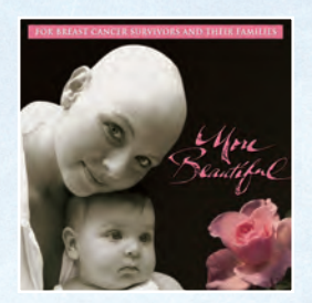
MORE BEAUTIFUL For breast cancer survivors and their families