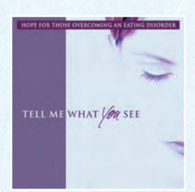
TELL ME WHAT YOU SEE For those overcoming and eating disorder