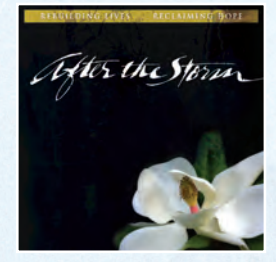
AFTER THE STORM Hope for those overcoming the storms of life