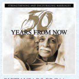
FIFTY YEARS FROM NOW For strengthening and encouraging marriages