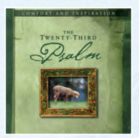
TWENTY-THREE To comfort and inspire

To purchase these CDs or for more information on our upcoming projects please visit us at www.musicforthesoul.org. Special discounts are available for counseling and recovery centers, churches, and other service organizations.