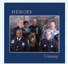
HEROES UNSUNG For Police officers and their families