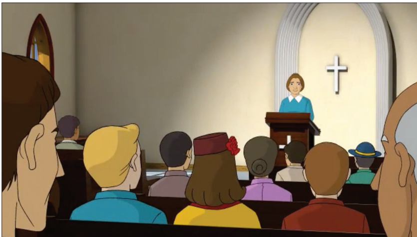
Corrie shares her story after her release.

Corrie ten Boom and her family operate a bustling watch repair shop in Holland, where they fix broken watches and return them safely to their owners. But as the evil of World War II sweeps through their city and the Jews are hunted down, a new type of “watch” comes into the ten Boom home: an innocent Jewish baby, desperately needing protection from the cruelty of the Nazi