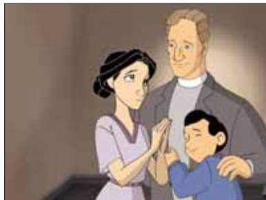
The Wurmbrands before the arrest.